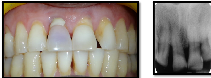
Figure 2. Pre-operative photograph and IOPA

A 47-year-old male patient reported with a chief complaint of pinkish discoloration from upper front tooth region since last 2 months. He gave past history of restoration in the same region on clinical examination gingival recession and restoration seen in relation to 11 and 21. (Fig 2) probing revealed pocket depth of 2mm.vitality was done. The pulp of adjacent and contra lateral teeth reacted normally to thermal and electric test whereas 11 was non-vital. A decision to endodontically treat 11 and the resorptive defects with MTA and simultaneously do scaling and curettage was made, treatment plan was explained to the patient and informed consent was taken.in tooth 11 access opening was done, canals was cleaned and shaped using stainless steel hand files, irrigated with 3 % NaOCl and CHX as the final irrigant. Canal was filled with Calcium hydroxide and sealed with cavit and patient was recalled advised 2%CHX mouth wash. Patient was recalled after 2 weeks for obturation. In between oral prophylaxis and curettage was done. After 2 weeks recall canal was cleaned and obturation just below the resorptive defect. The resorptive defect was filled with MTA, the excess was removed and defect was closed with composite. (Fig 4) The patient was instructed to maintain oral hygiene. Follow up showed favourable healing.