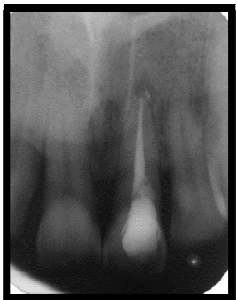
Figure 4: 3 months follow-up radiograph of the tooth